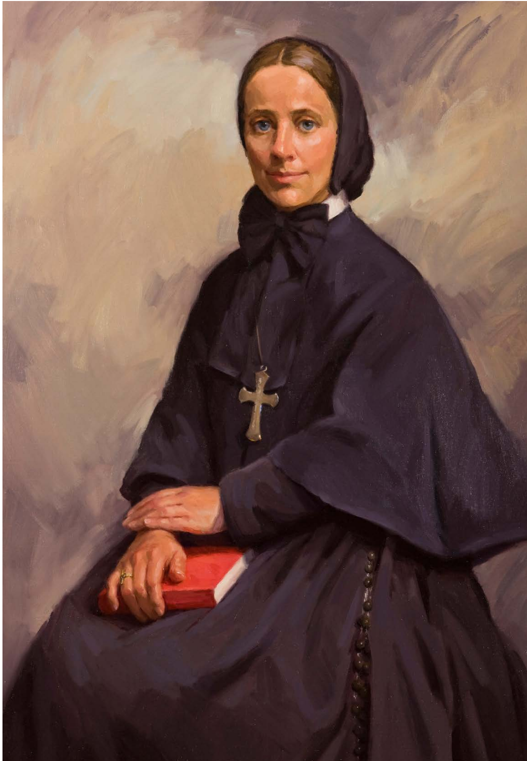
St. Frances Xavier Cabrini, M.S.C. Patron Saint of Immigrants