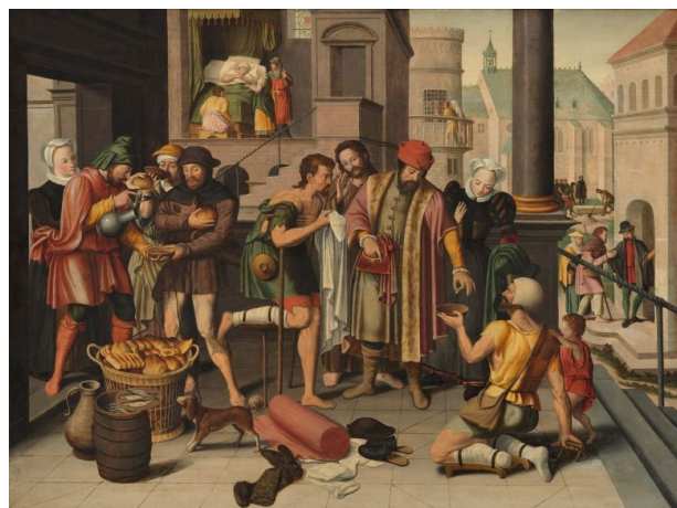
The Seven Corporal Works of Mercy, Haarlem School (1580), Museum Boijmans Van Beuningen

Avoiding bad things isn’t enough: we must also pursue good ones. So Jesus said: Pray like this: Provident God, give us the bread and forgiveness we need! Christians intercede before God to shower our world with blessings, opportunities and mercies. We think of those most wonderful gifts—the daily bread of the Holy Eucharist and daily forgiveness of sacramental Reconciliation—gifts for which we’ve hungered during this pandemic and that our Plenary Council is so concerned to ensure will be widely available in the future.